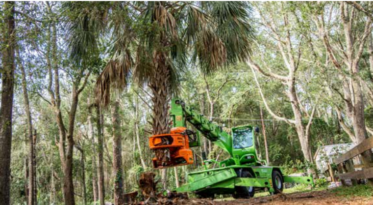
Woodcracker® CS750 smart on Merlo roto-telehandler - application in Florida