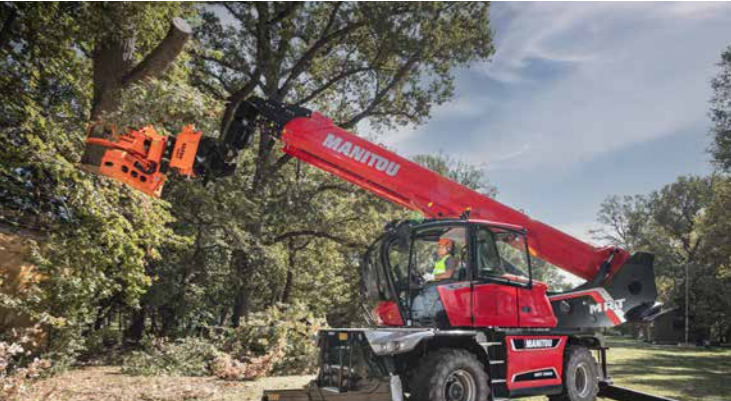
Woodcracker® CS750 smart on Manitou roto-telehandler - upright removal of tree sections