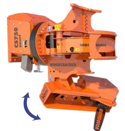
saw unit has a swinging chassis with active suspension