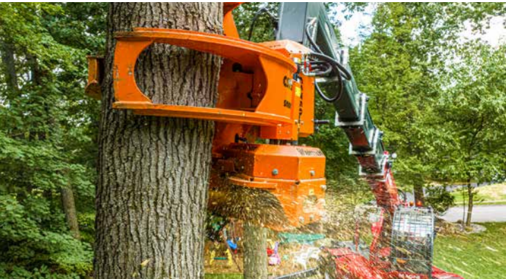
Woodcracker® CS750 smart on a Magni roto-telehandler - large diameter