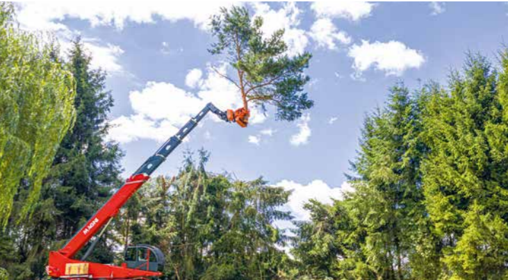
Woodcracker® CS615 smart on Magni roto-telehandler - high-reach work