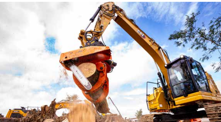
Woodcracker® CS800 dualGrip on CAT325 crawler excavator - high sawing performance