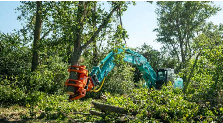
Woodcracker® CS800 dualGrip on Kobelco SK300 crawler excavator - the strong grippers hold the tree firmly