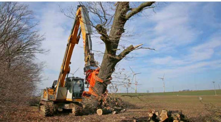
Woodcracker® CS800 dualGrip on Liebherr LH30 crawler excavator - handling even the thickest logs