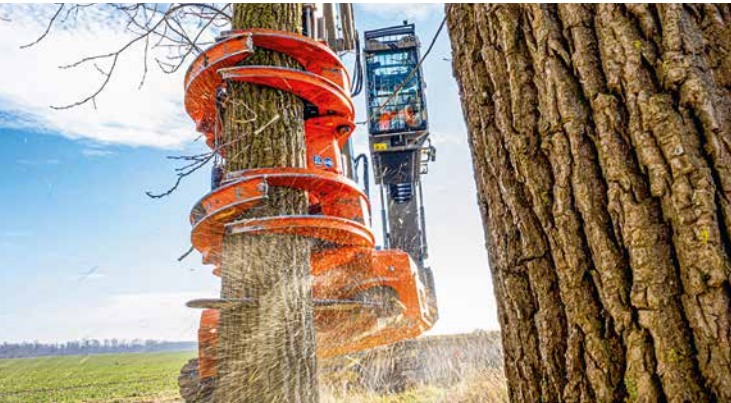
Woodcracker® CS800 dualGrip on Sennebogen 825 crawler excavator - the grapple adapts to the tree