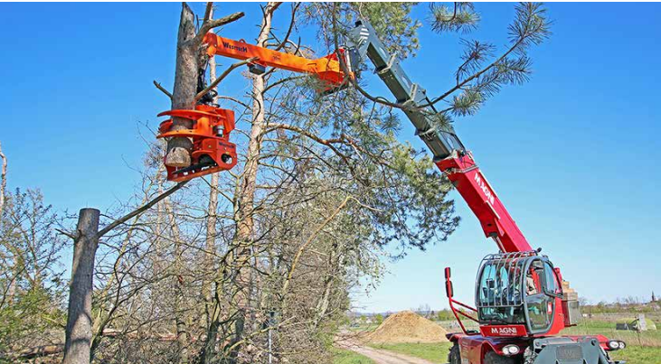
Woodcracker® CS620 crane with extension on a telehandler