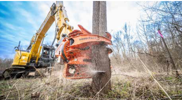
Woodcracker® CS545 compact on Kobelco SK140 crawler excavator - high sawing performance