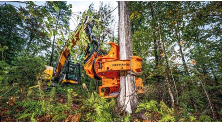
Woodcracker® CS610 on LH R914 crawler excavator - safe grip during the sawing process