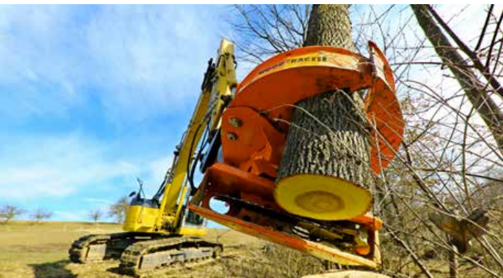
Woodcracker® CS610 compact on Komatsu 225 crawler excavator - high-diameter sawing