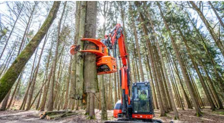
Woodcracker® CS545 compact on Kubota KX80 crawler excavator - safe holding of stem material