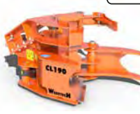
Woodcracker CL190 + accumulator