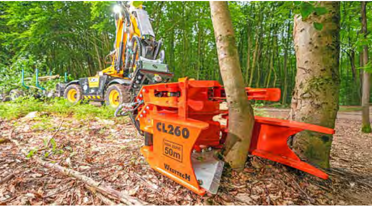
Woodcracker® CL260 on JCB Hydradig wheel bagger - combined with timber forwarding trailer