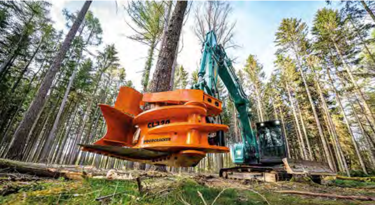
Woodcracker® CL320 on Kobelco SK140 crawler excavator - harvest of small trees