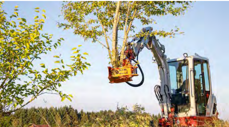
Woodcracker® CL140 on Takeuchi TB225 crawler excavator - removal of small trees and bushes