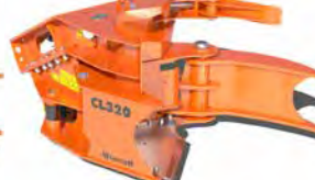
Woodcracker CL320 + accumulator