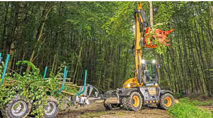
Woodcracker® CL260 on JCB Hydradig wheel excavator - with timber forwarding trailer for efficient working