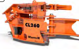
Woodcracker CL260 + accumulator