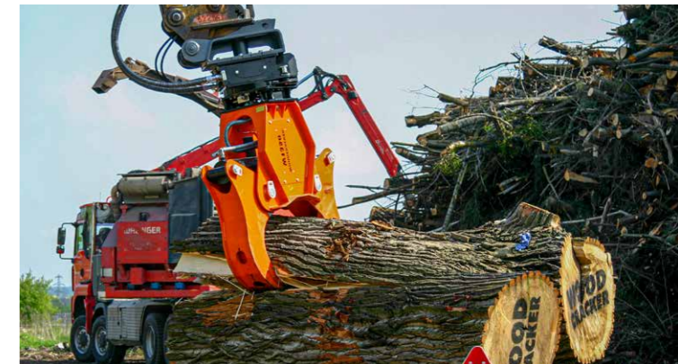
Pre-splitting wood allows a natural drying process.