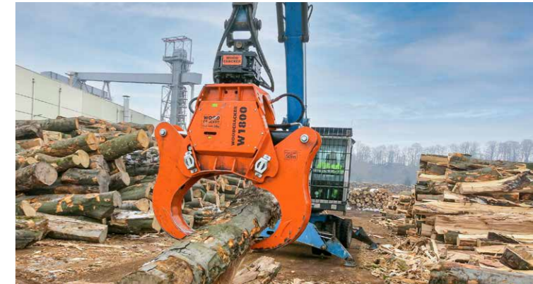
Splitting thick wood trunks with minimal effort.