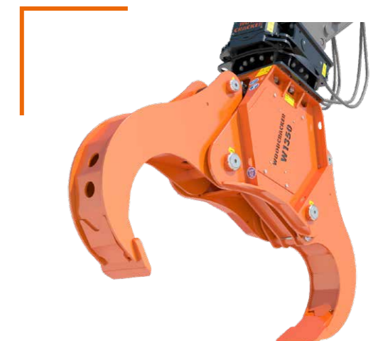
endlessly rotatable Rotator for flexible application