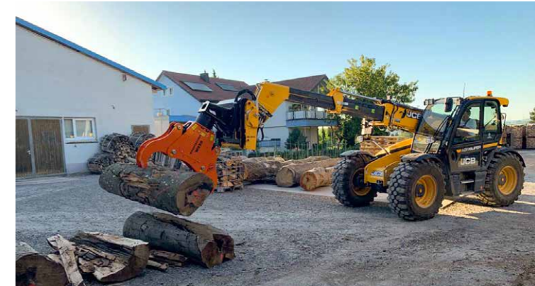
Various mounting options.