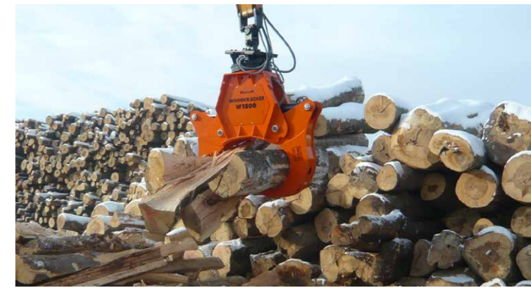
Easy supply of the pre-split material to chippers.