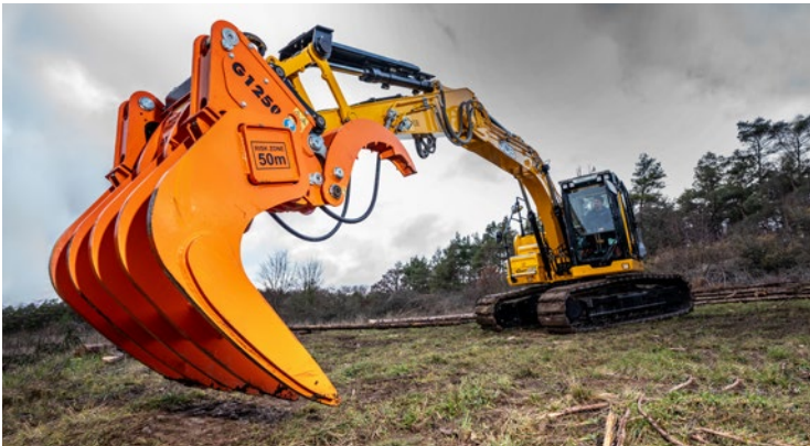
Mountable to all common carrier vehicles.