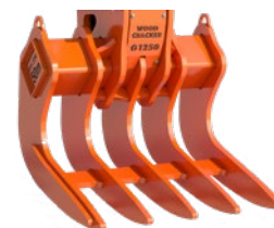
Woodcracker® G without gripper fingers