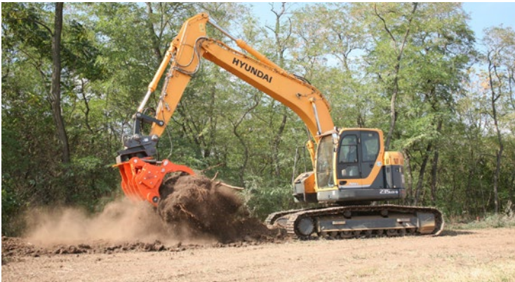
Clearing and caring of large areas.