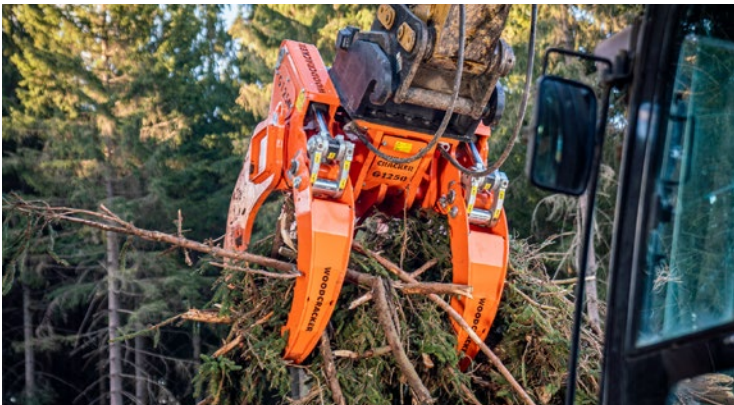
Very large capacity.