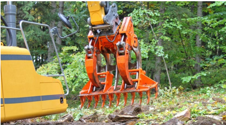
Woodcracker® G1250 with fine rake.