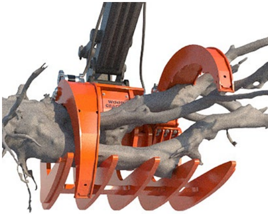
The gripper fingers adjust individually to the crop.